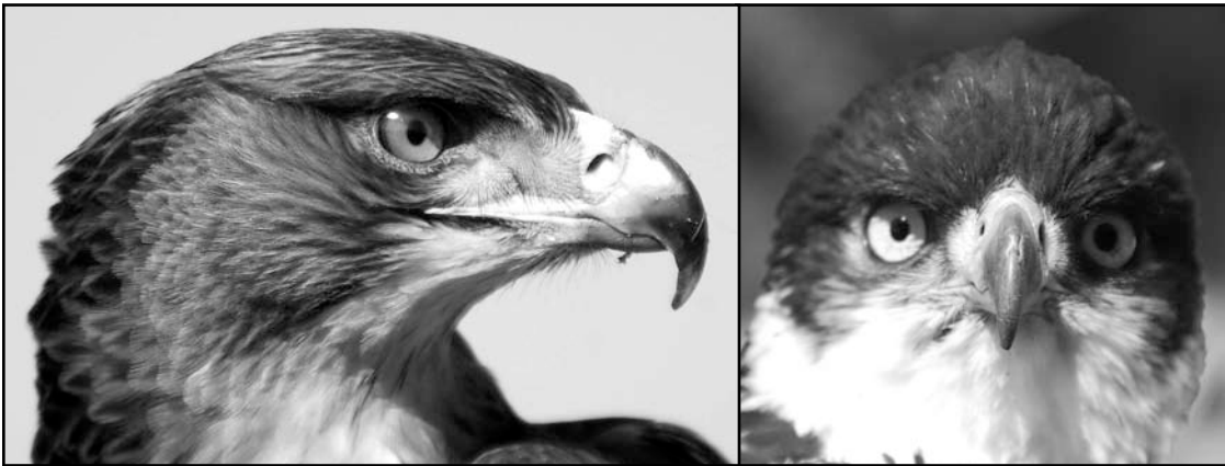
Far left: African Hawk-Eagle, immature plumage. This one had just taken a hare.