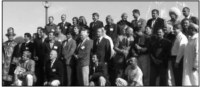
The Delegates of the 2008 International Association for Falconry and Conservation of Birds of Prey.

The IAF AGM Delegates role appears to be a diplomatic opportunity for representatives from different countries to come and build relationships, but first you have to be lucky enough to be able to afford the meetings. Its Executive, and appointed Advisory Committee (AC) do most of the work