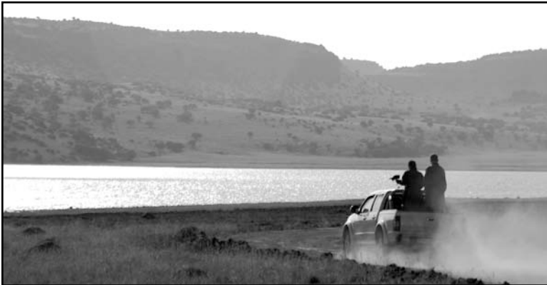
Minutes after our arrival in Thaba N'Chu we embark on our first hunt in the adjacent 15,000 acre Maria Moroka National Reserve.