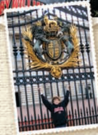
Below: Marshall in London.